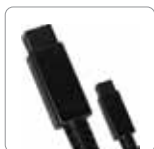
FireWire 800 Cable