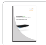
Quick Installation Guide