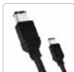
FireWire 400 Cable