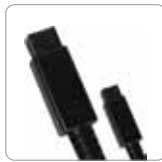
FireWire 800 Cable