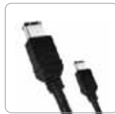
FireWire 400 Cable