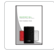
Quick Installation Guide